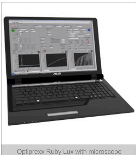
Optiprex Ruby Lux with microscope